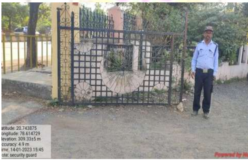
SECURITY PERSONNEL GUARDING THE GATES