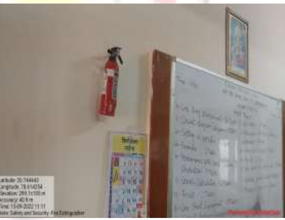
FIRE STAFETY INSTALLED IN THE CAMPUS