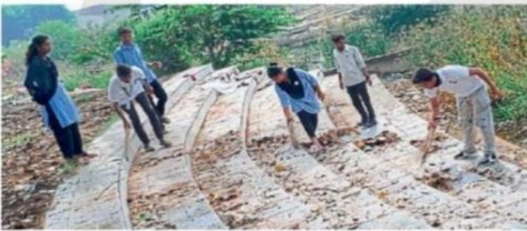
वर्धा : स्वच्छता मोहिमेत सहभागी विद्यार्थी.